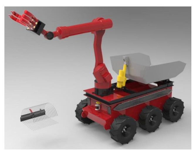
Figure 3 - Debris cleaner

Figure 3 is a clean-up system for debris; the unit is a hybrid combining a dump body and a 6-axis arm. The dump is 60% the length of the omni-chassis (could be longer but would overhang the rear of the omni-chassis. The other 40% is taken up with a 6-axis arm utilizing different end-effectors. For debris cleanup a 5 or 6 finger end-effector would be used to move material to the dump. Once the dump was full it would trundle off to a set point to dump the load. The advantage of this payload is it can function day or night and rain or shine, it does not care.