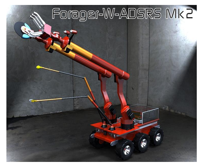
Figure 4 - Disaster SaR