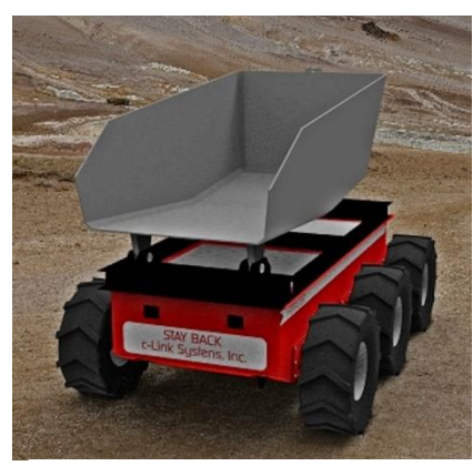
Figure 2 - Dump Body

All of the examples are designed to fit the same omni-chassis.